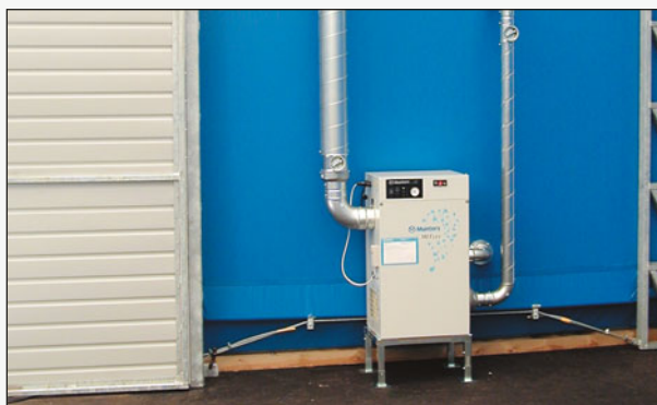
PMH Dry Air Hall is equipped with a suitably sized dehumidifier.