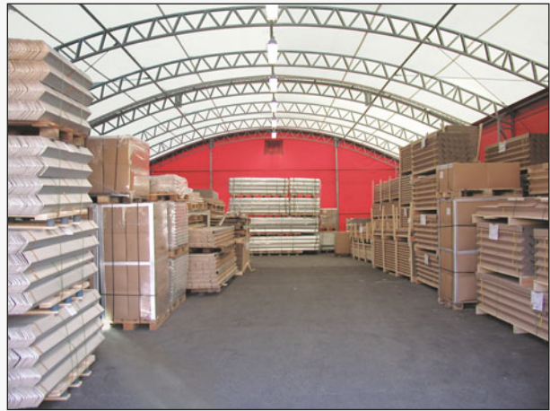
PMH Rental Hall offers a maximum useable floor space, with no invasive columns and a translucent roof.

The structure is easy to erect. Can be carried out by the customer, with assembly instructions provided or by professional supervision. It can be also offered a complete delivery and installation service.