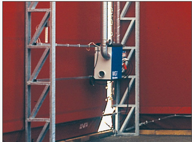
PMH Rental Hall can be furnished with a dehumidification unit to secure a controlled indoor environment.